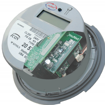
WebGate TotalPoint Meter Interface Module

Data acquired by TotalPoint MIMs is collected by strategically positioned TotalPoint Gateways and then backhauled by any available IP-based network. All network management and command and control functionality is seamlessly handled muNet's WebBot™ Central Control Web-based software.